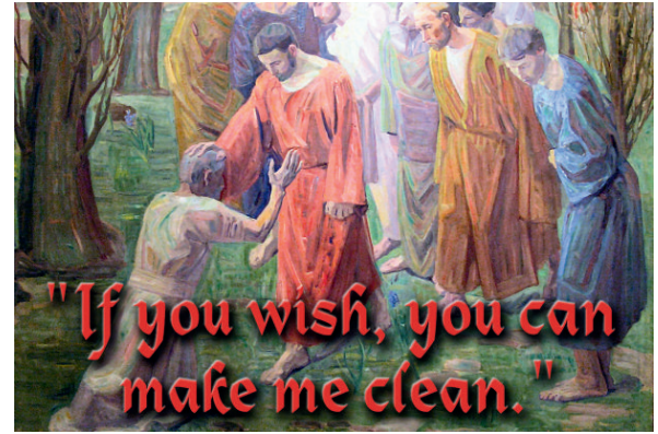
Readings for each day and links to daily reflections can be found at <u>stpacc.org/readings</u>

Most merciful Lord, You desire all of Your children to be healed of the many sins that keep them from communion with You and with Your people. Please give me the faith and trust I need to always be able to humble myself before You so as to receive the restoration to Your grace I so desire. Jesus, I trust in You.