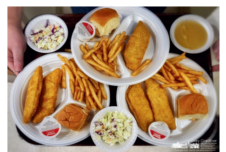
Adult Meal - $15.00 Seniors (65+) - $12.00 Children (6-11) - $6.00 Family - $50.00 (Parents + 3 or more kids) Slice of Pizza - $4.00 Desserts - $2.00 Soups - $4.00